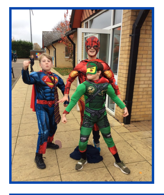
This is what our lunch times look like in the Winter...